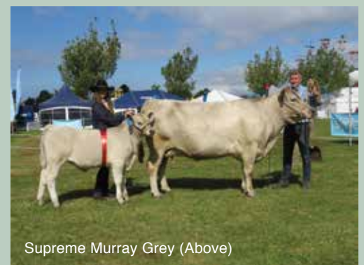
Supreme Murray Grey (Above)