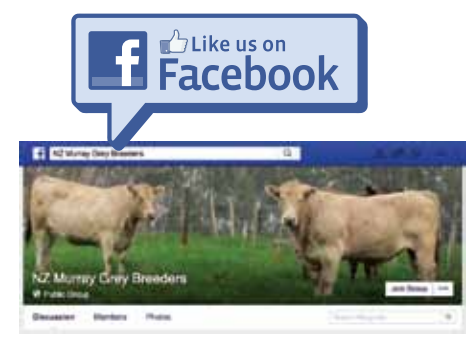
NZ Murray Grey Breeders