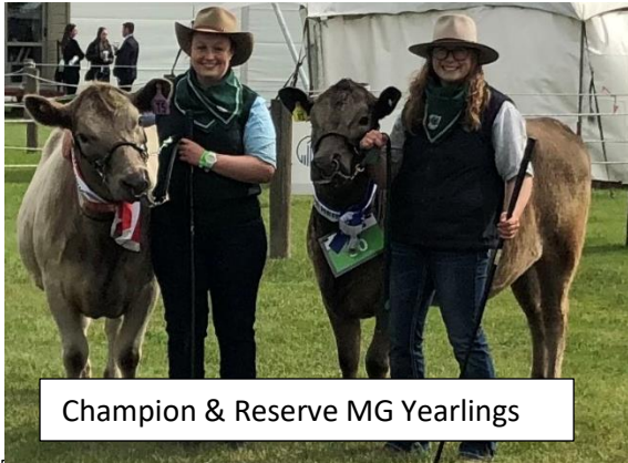
Champion & Reserve MG Yearlings

It was a great week, with good advertisement for the breed at one of New Zealand's biggest shows. Congratulations to all exhibitors for representing the Murray Grey breed so well.