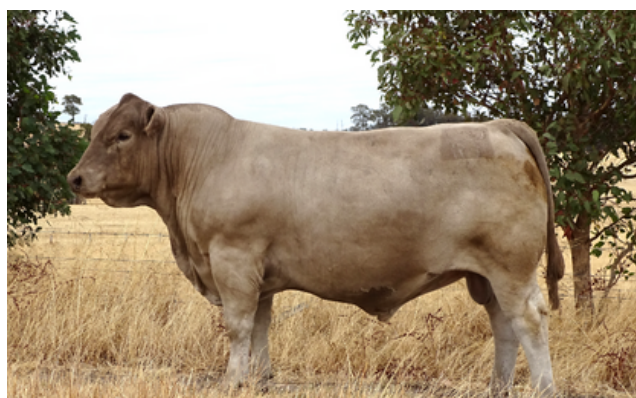
Feature sire Venturon Rectify R1

We invite fellow breeders, commercial buyers, and anyone with an interest in high-quality, performance-bred Murray Greys to join us on sale day and see the results for yourself.