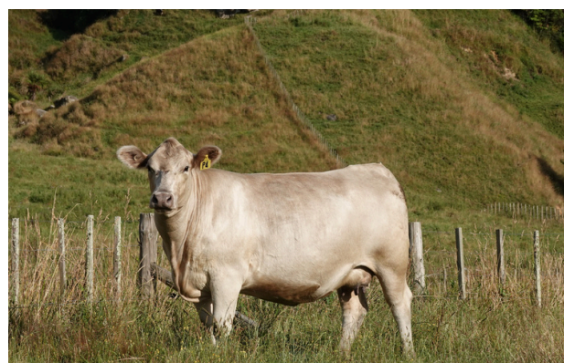
A foundation female, Oakview Poppy P4